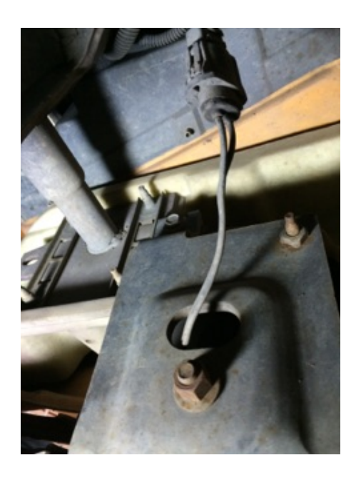
Step 1: Using your hands unplug the connector coming from the back of the fog light.

Removal Procedure : Looking from under the car behind the fog light you will see a 15mm nut and a connector that will need to be removed.