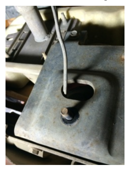
Step 3: Once removed pull the fog light from its bezel in the front bumper.