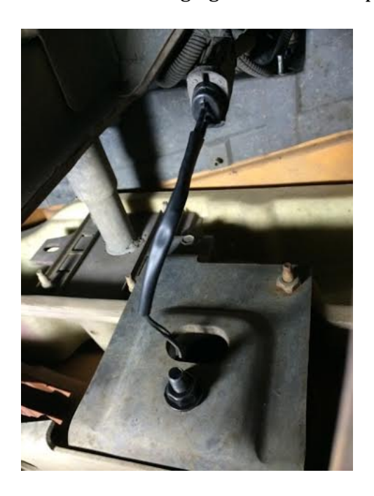
Step 6: Connect the connector from the fog light to the corresponding plug.