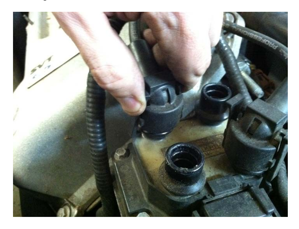
Repeat steps 5-7 on other side

8: Install new Ford Racing plug wires. Note that each wire is labeled with its cylinder number. Look at the image below for wire locations.