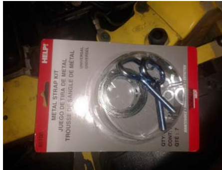
Metal Strap Kit $7

Ratchet 8mm socket 10mm socket Pliers Metal straps Nuts, Washers, Bolts