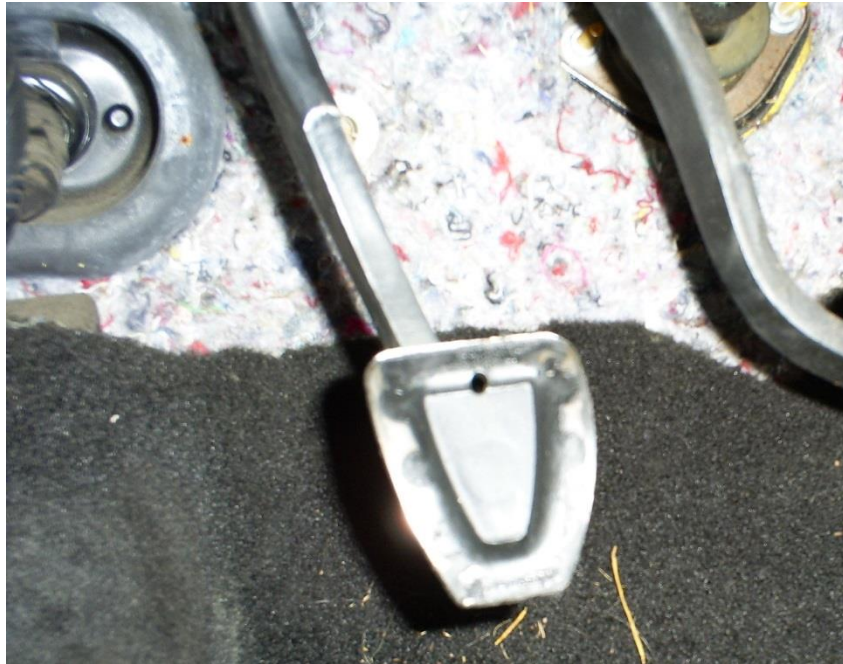
Figure 1. Pedal with cover removed.