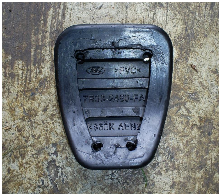
Figure2. Rubber pedal cover pad removed (back side)