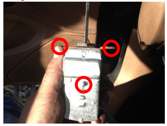
STEP 4: Unplug the headlight switch by pulling out on the two clips.

STEP 3: Remove the (2) 8mm nuts that retain the headlight switch in the car. Press down on the silver button and pull out on the shaft to release it from the headlight knob.