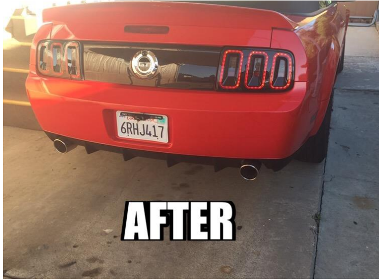
Installation Guide Created and Submitted by AmericanMuscle Customer Eddie Perdomo on 06/28/2016