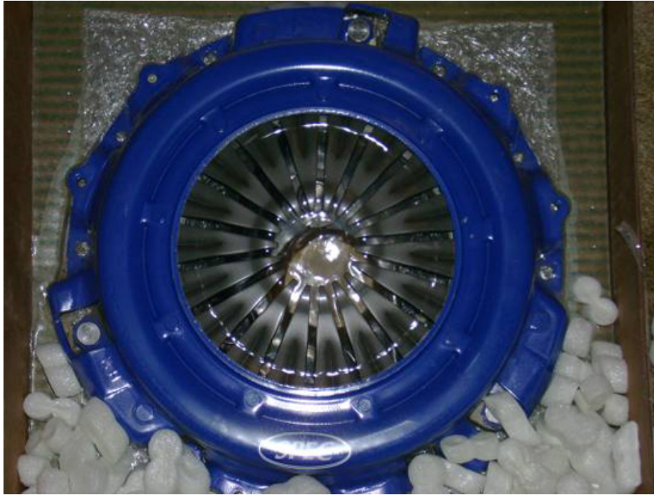
Spec Clutch new in the box