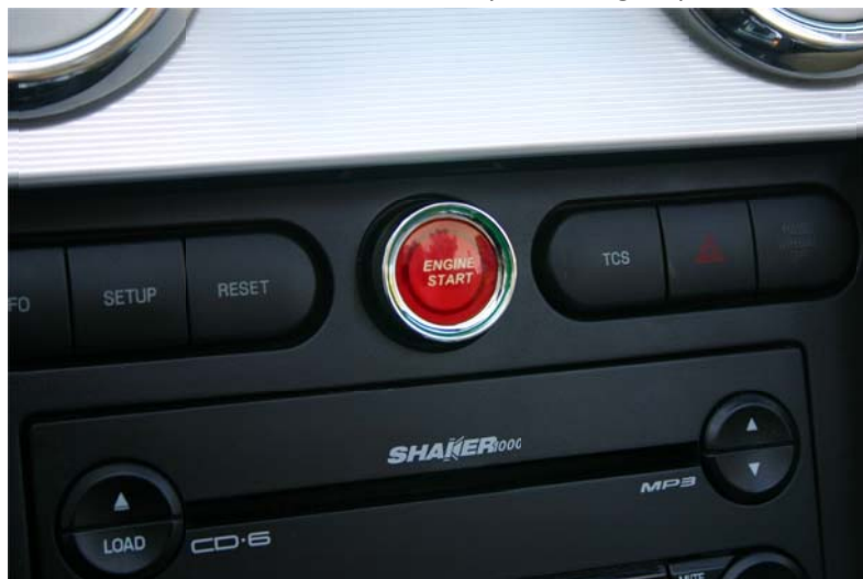
Completed Installation shown above.