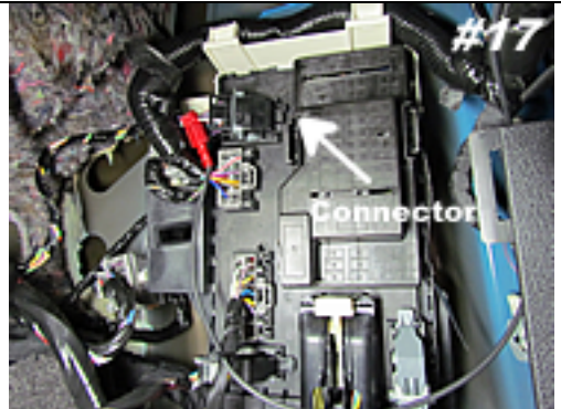
Another view of the proper connector after connecting harness to white wire