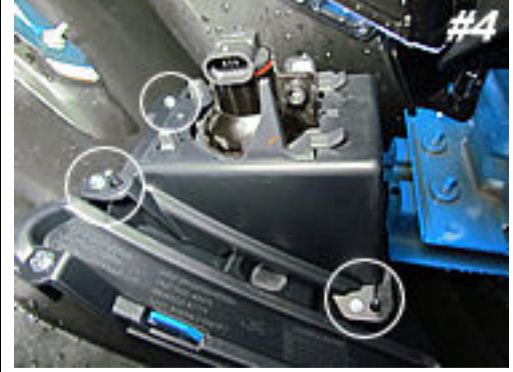
Drivers side fog light shown - looking upward from ground.