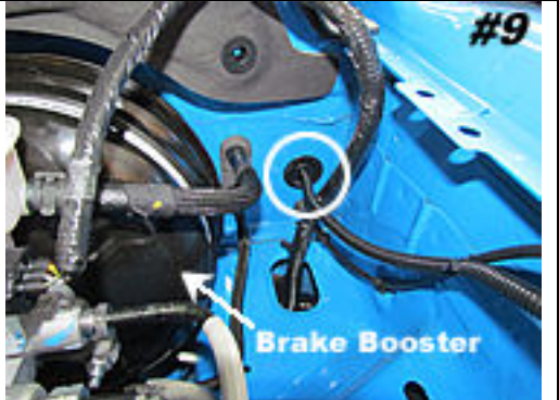
Cut small "X" in grommet and route wiring through the hole.

5. Connect the orange wire to the positive (+12 volt) power cable entering the fuse box shown in picture 7 above. A 10mm socket or wrench can be used to remove the bolt holding the +12v power supply cable. A ring terminal is located at end of the orange wire which will slide over the post.