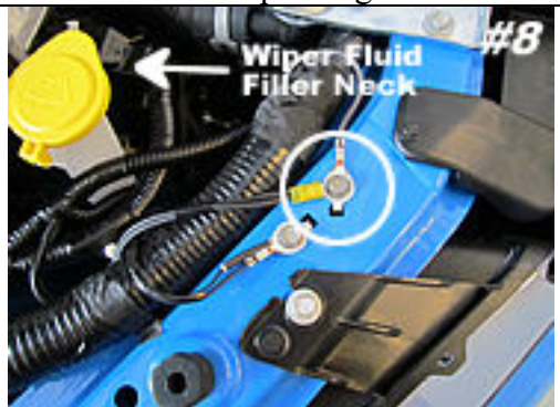
Attach ring terminal to bolt circled above. Firmly re-tighten the bolt.