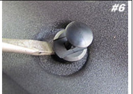
Pry up on center part of pin first. Then pry out entire retainer pin.