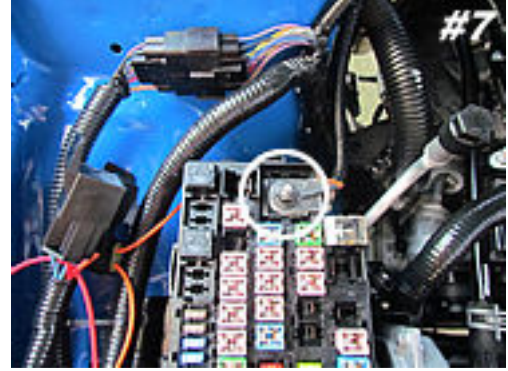
Be sure that the bolt is re-attached tightly enough that it will not loosen.