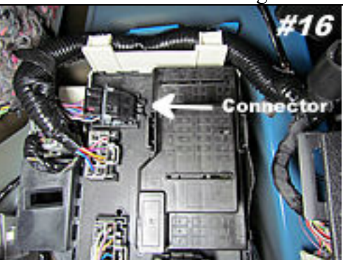
Connect to white wire on connector shown above using a wire tap.