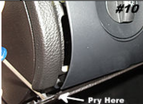
Pry downward slightly. Be gentle and Pry up gently to loosen switch panel. cautious when doing so.