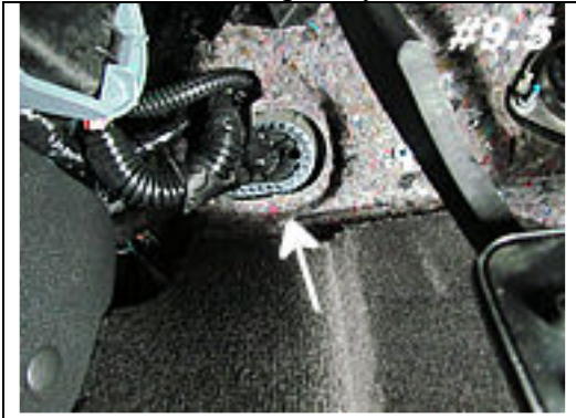
Cut small "X" in boot and route wiring through the hole.