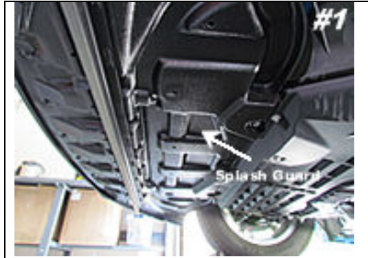
Black splash guard should be removed. It is held by 17 screws.