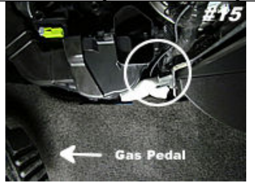
Pass black wire through the center console to passenger side kick panel.