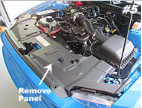
Remove black panel shown. Save 8 retaining pins for re-install later.