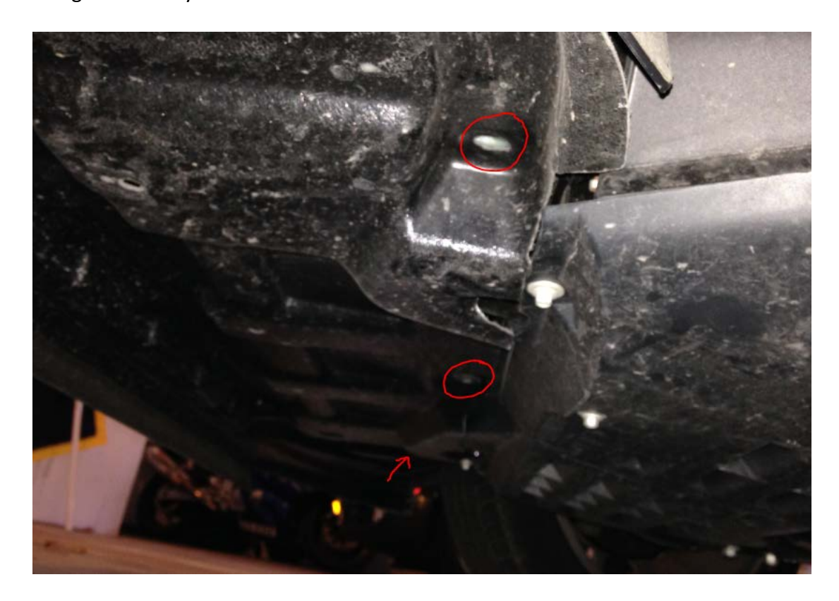
5: Along the front of the factory splitter, remove the 12-7mm bolts holding on the air deflector. 5 are shown below circled – the remaining 7 follow the same pattern along the front of the splitter.

4: Remove the 3-7mm bolts attached the air deflector furthest back near the oil pan cover. 2 are circled below and the remaining is shown by the arrow below.