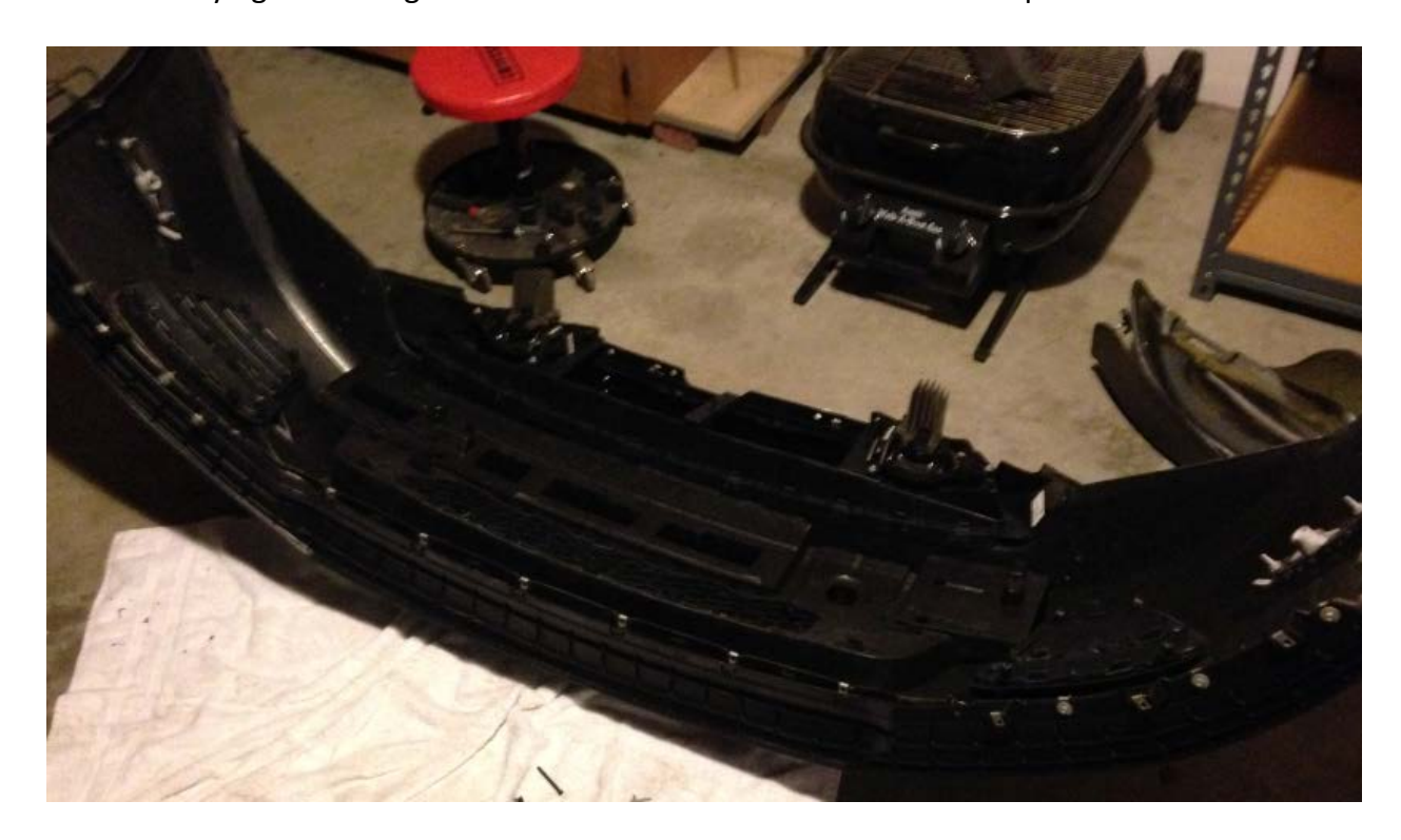
Part 2: Splitter Installation

12: Remove the 3 plastic clips on each side with a flat head screw driver on the inside of the bumper.