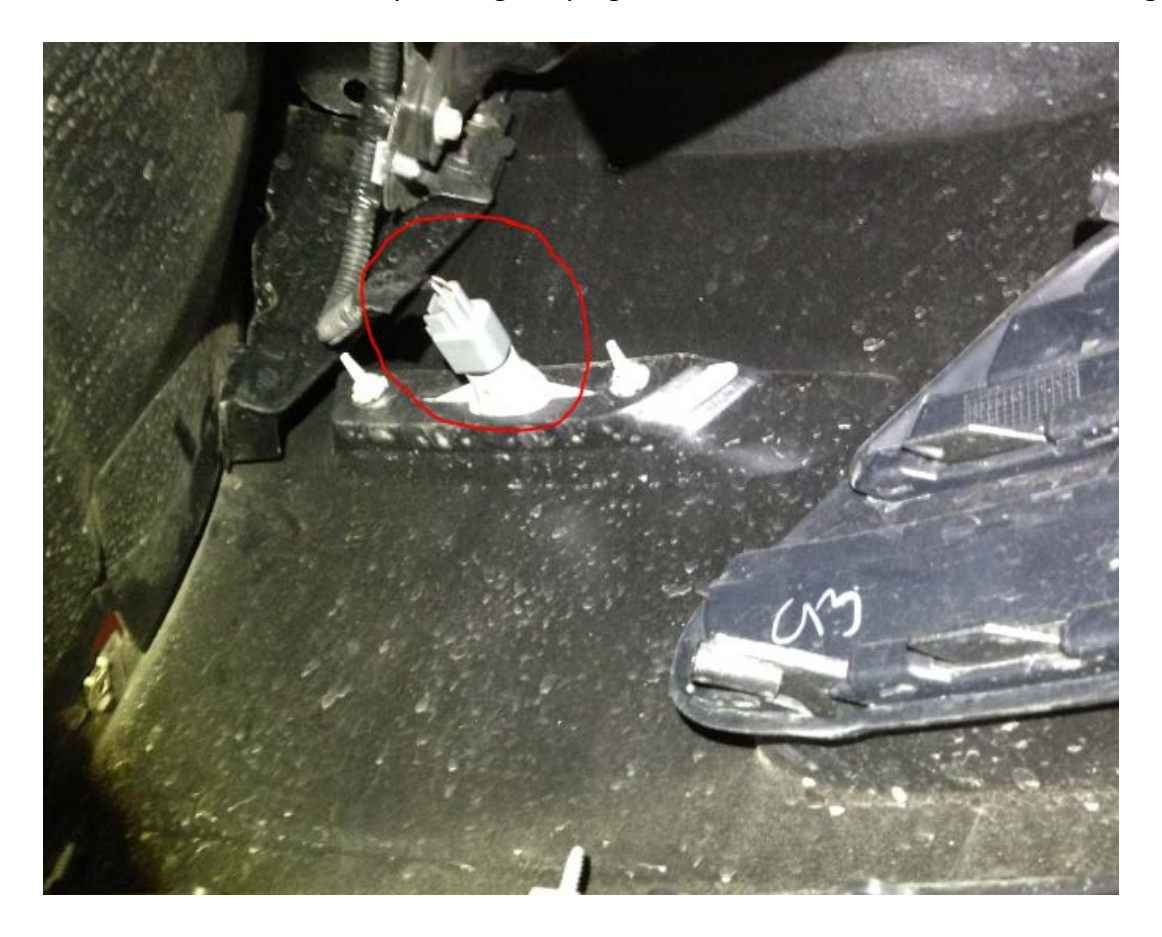
8: Unplug the ambient air thermometer by pulling downward.

7: Unplug the side marker on each side by turning the plug so the flat side faces down before sliding out.