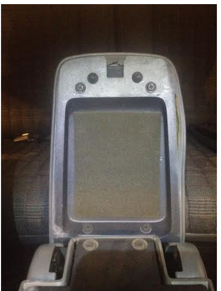
Step 1: Start by opening the center console arm rest.