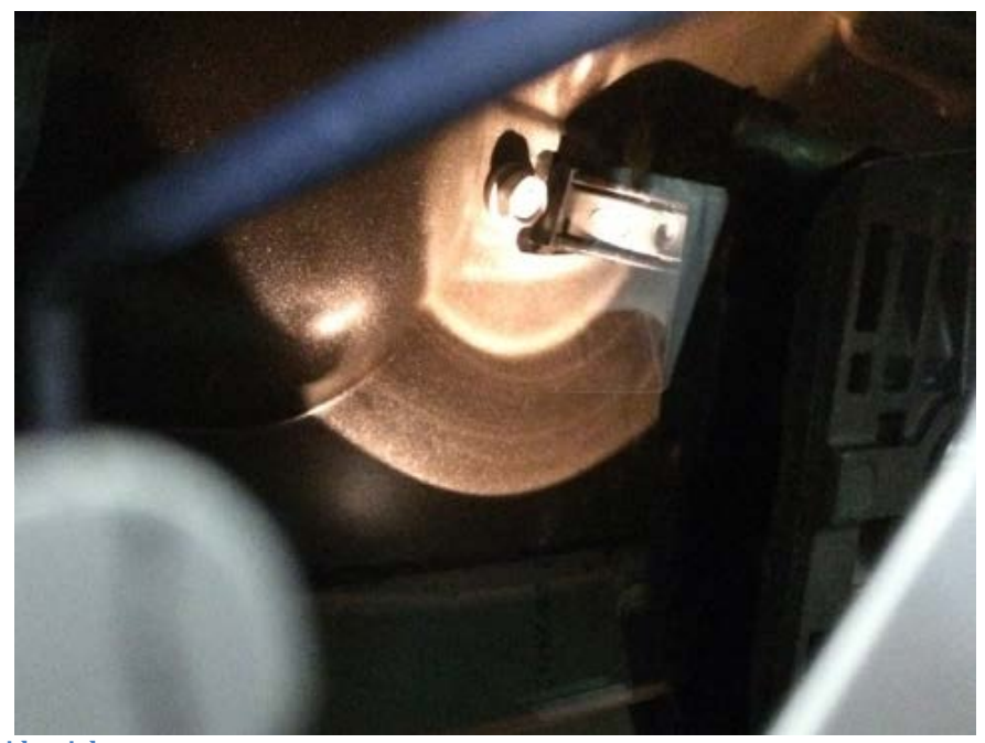
Figure 2Driver side, right-most nut