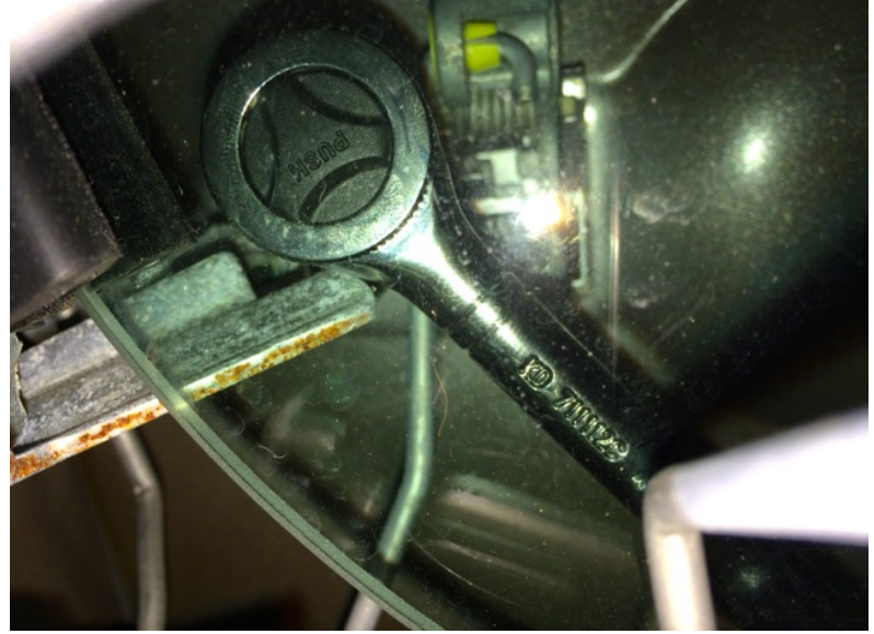
Figure 3Driver side, left nut (near lock mechanism)

7) Loosen and remove both nuts using a 10mm ratcheting or open-end wrench, being careful not to let them drop into the abyss. Set aside. You may be able to use a 3/8 drive and short well 10mm socket (not listed in tools needed)