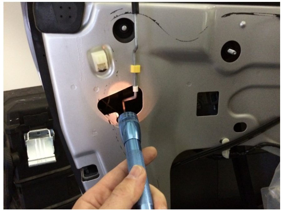
Figure 1Hole used to see the nuts

6) Use the flashlight and find the two hex nuts on inside at same height as the handle. They aren't too hard to reach with one hand, inside the door frame.