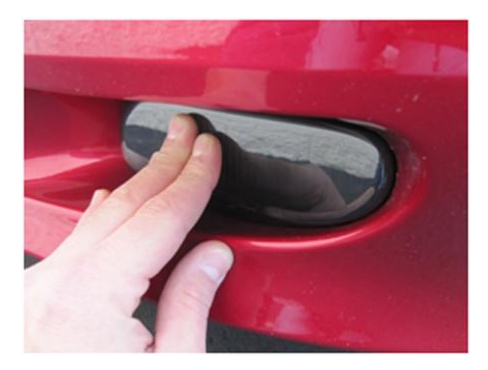
Installation instructions provided by Manufacturer.

2. Push the top edge of the light cover over the top of the fog light as shown. Repeat for opposite side to complete the installation.