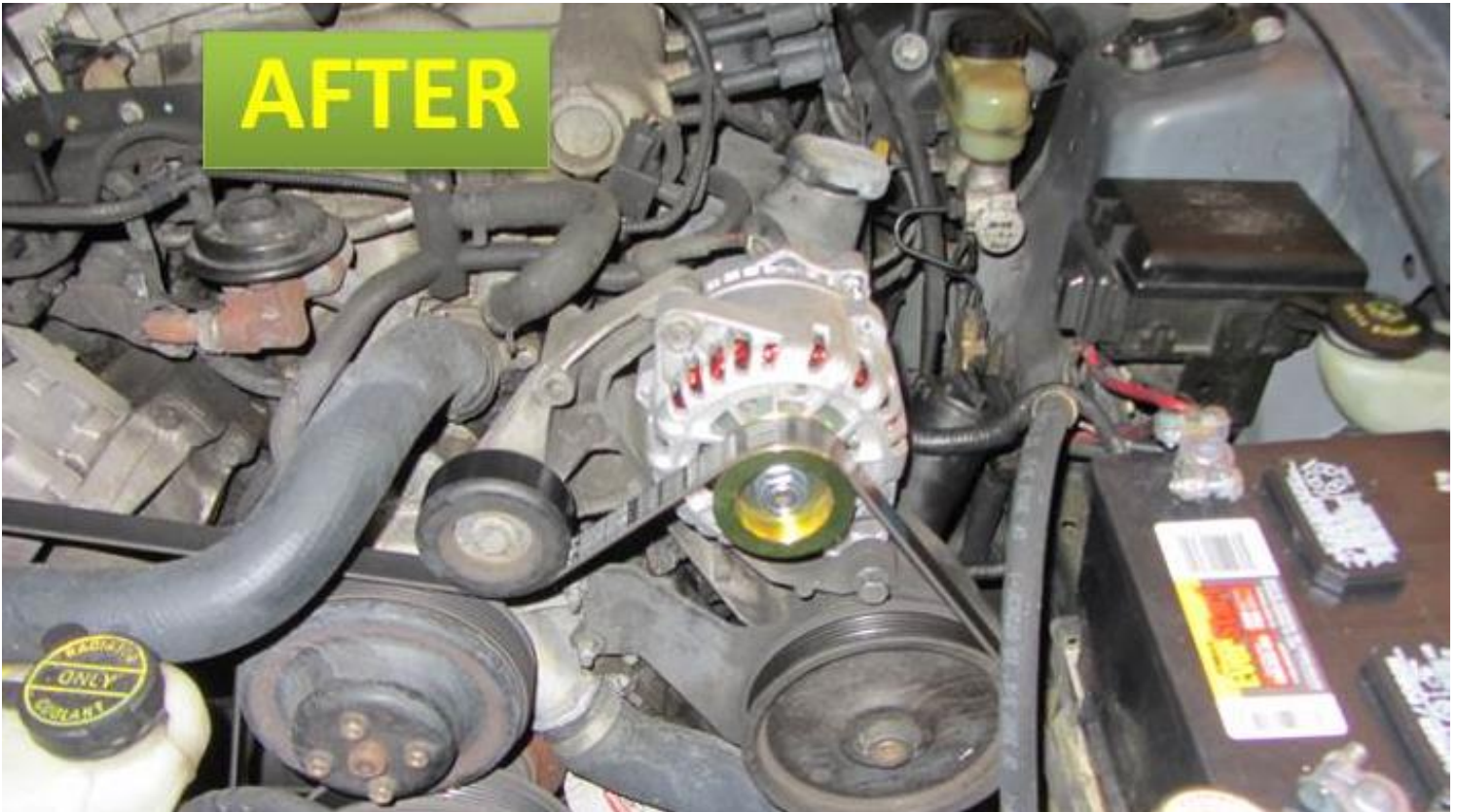
Instructions written by American Muscle customer Chuck Juracsik 07/18/16 2004 Mustang V6