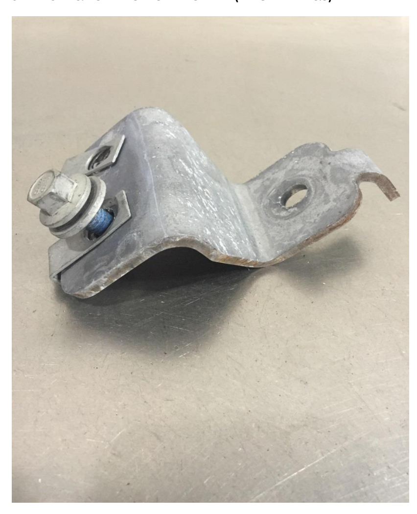
SPEED CLIP & BOLT FROM OEM BUMPER (DIAGRAM #7 &8)