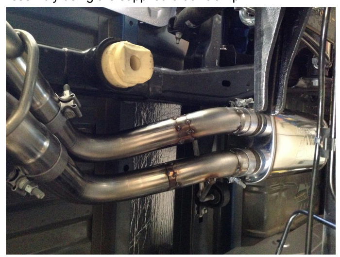
Step 4. Install both the Over Axle Pipe Assembly and Tail Pipe Assembly using the supplied 2.50" clamps. Locate the welded hangers to the OEM rubber insulators.