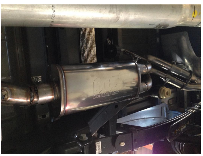
Step 3. Install the Muffler Assembly to the Inlet Pipe Assembly using the supplied 3.00" clamp.