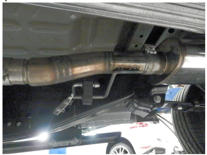
Step 2. Install the new system by attaching the Inlet Pipe Assembly to the OEM catalytic converter outlet pipes using the existing clamp and hardware. Locate the welded hanger to the rubber insulator. Leave all clamps and fasteners loose for final adjustment of the complete system once installed.