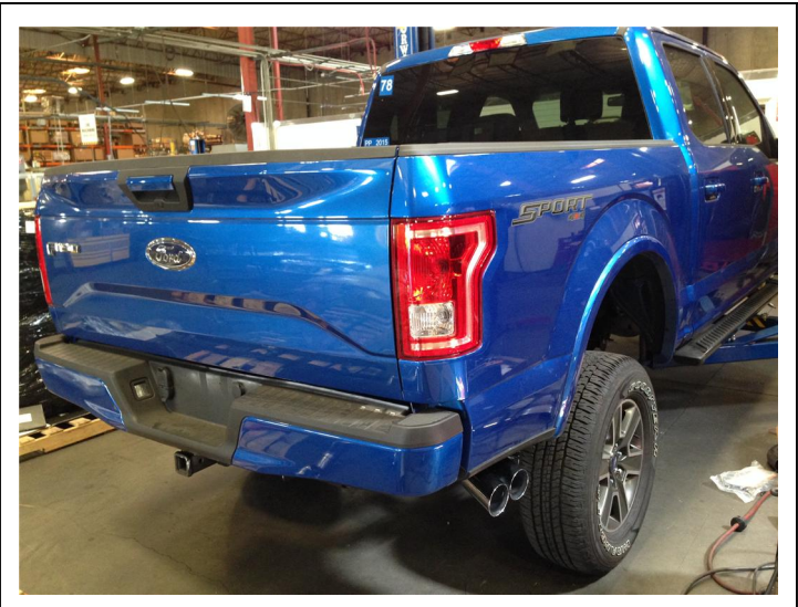
Step 5. Once a final position has been chosen for the new exhaust system, evenly tighten all clamps from front to rear using the torque specifications on page one of the instructions. Inspect all fasteners after 25-50 miles of operation and re-tighten if necessary.