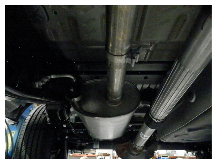
Step 1. To remove the OEM exhaust system, loosen the clamp attaching the systems inlet pipes to the catalytic converter outlet pipes. Disengage all welded hangers from the OEM rubber insulators. Do not discard the OEM fasteners or damage the rubber insulators as they will be needed to mount your new MAGNAFLOW system.