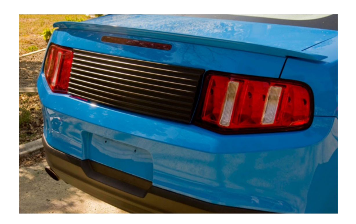
Installation instructions provided by AmericanMuscle customer Cory Rankin 4.7.10

Find more how-tos , instructions and videos at <u>www.americanmuscle.com</u>!