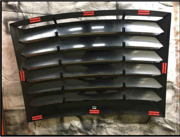
Figure C: Brackets Attached to Window Louvers

NOTE: Do not fully tighten the nuts, they will be removed at a later step.