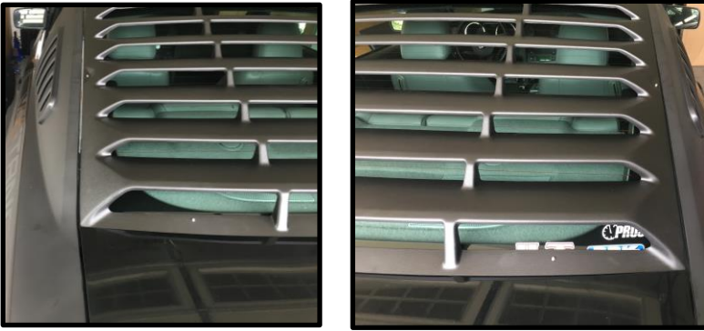
Figure E: Louvers Centered on the Rear Glass