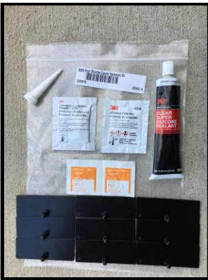
Figure B: Hardware Kit