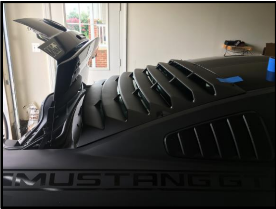
Figure D: Alternate Procedures to Align the Louvers onto the Rear Glass