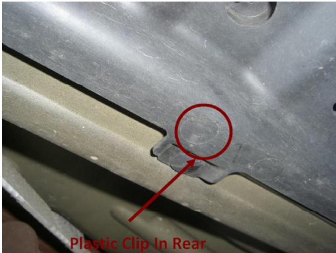
Plastic Clip In Rear