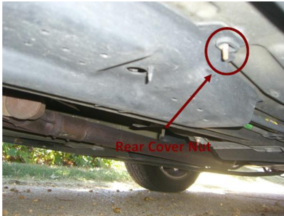
Rear Cover Nut