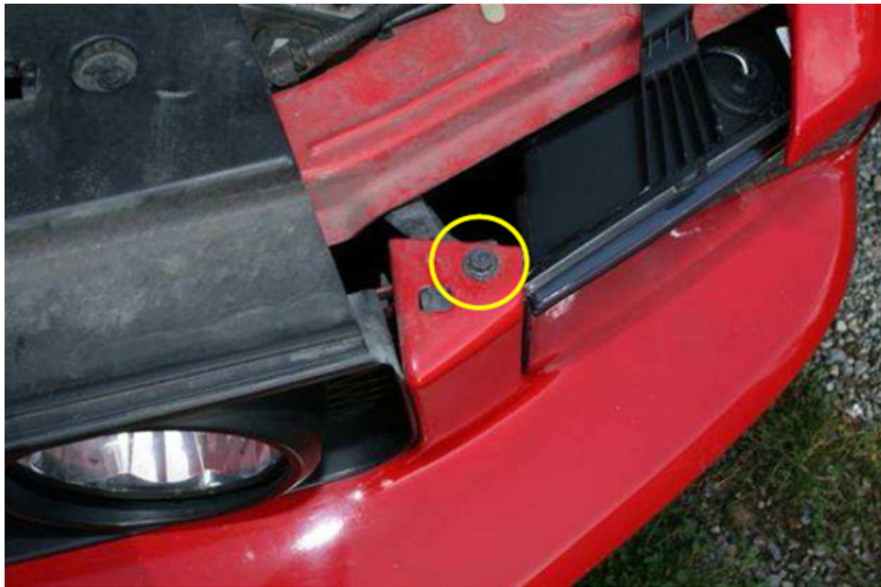
Figure 3 Left Side Shown