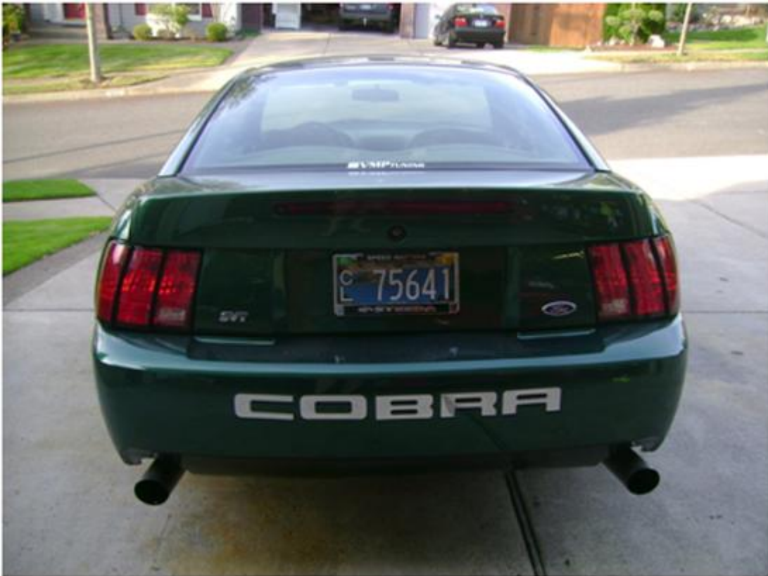
And finally here is a comparison of the factory lights (Top) to the new Smoked lights. (Bottom)