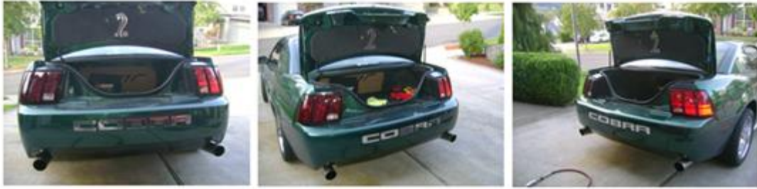
Here is a comparison of the new smoked light (Driver Side) to the factory light. (Passenger Side)